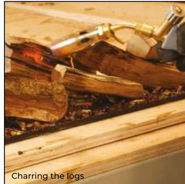
Charring the logs