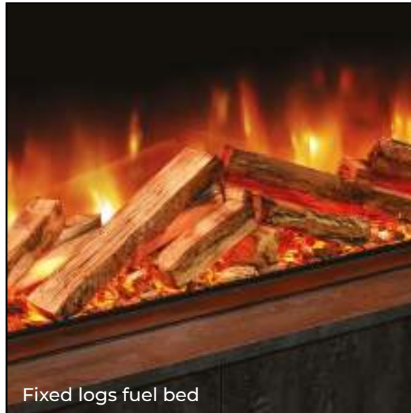
Fixed logs fuel bed