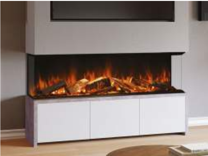
GF3 - three-sided