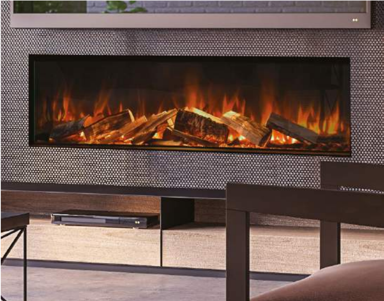
GF - one-sided