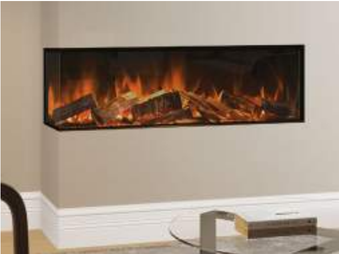
GF2 - two-sided