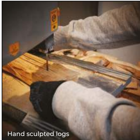
Hand sculpted logs