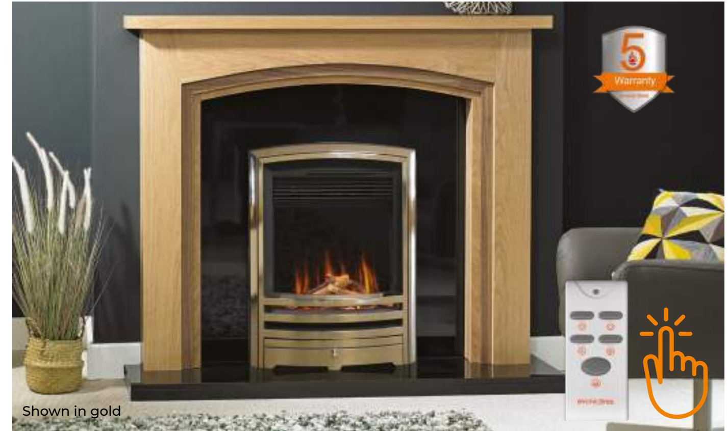
Shown in gold