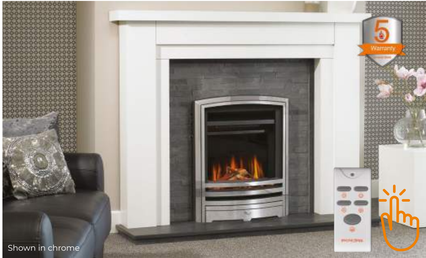
Shown in chrome