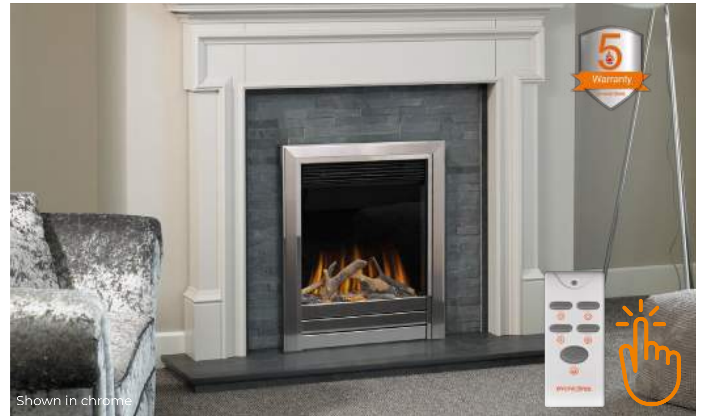
Shown in chrome