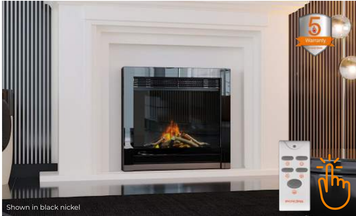
Shown in black nickel