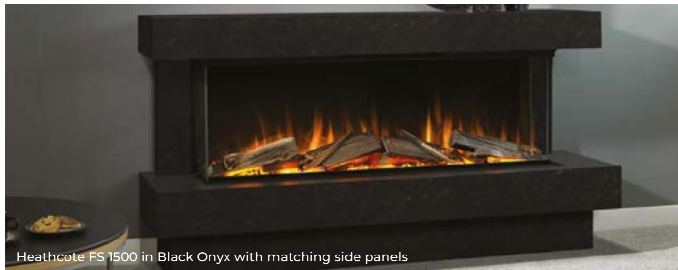
Heathcote FS 1500 in Black Onyx with matching side panels