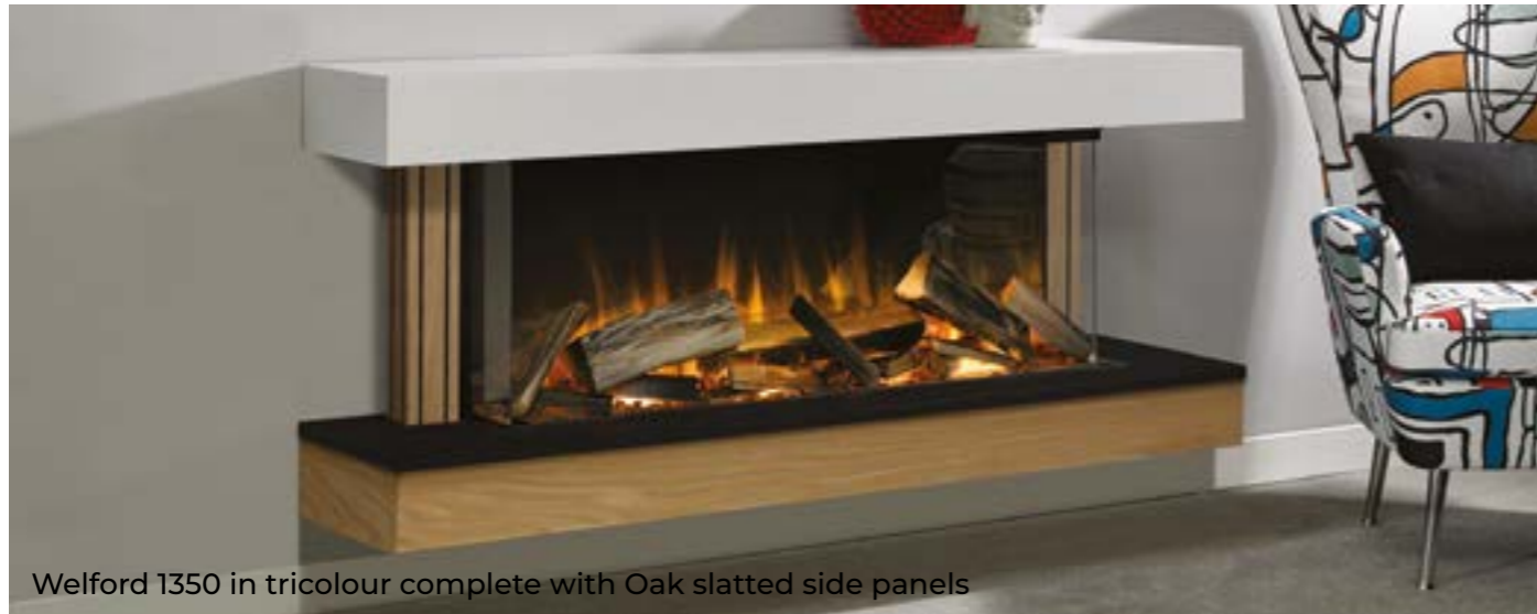
Welford 1350 in tricolour complete with Oak slatted side panels