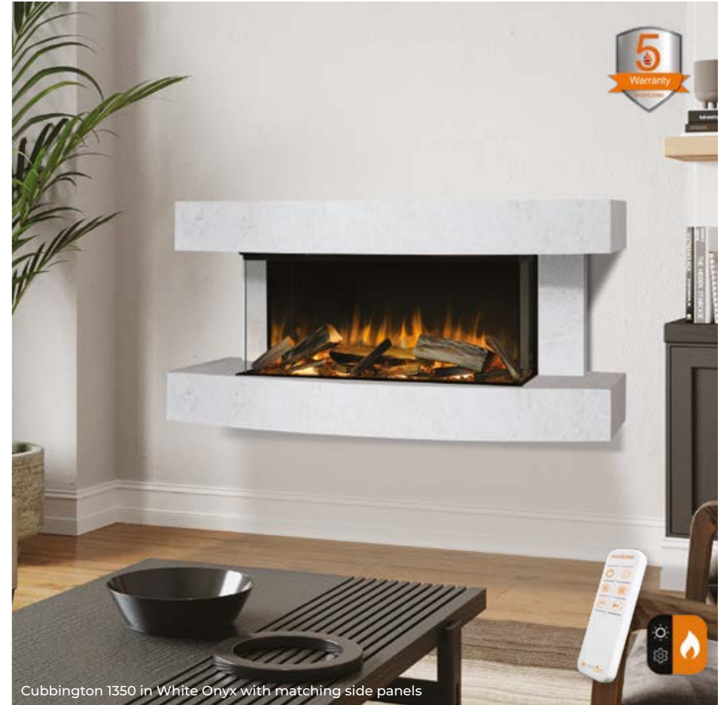
Cubbington 1350 in White Onyx with matching side panels