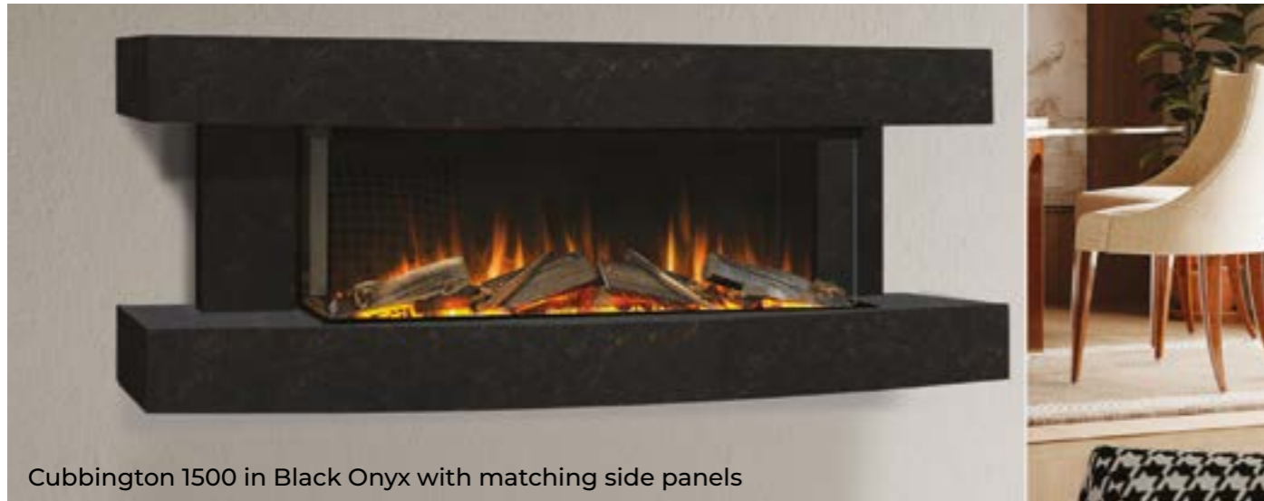
Cubbington 1500 in Black Onyx with matching side panels