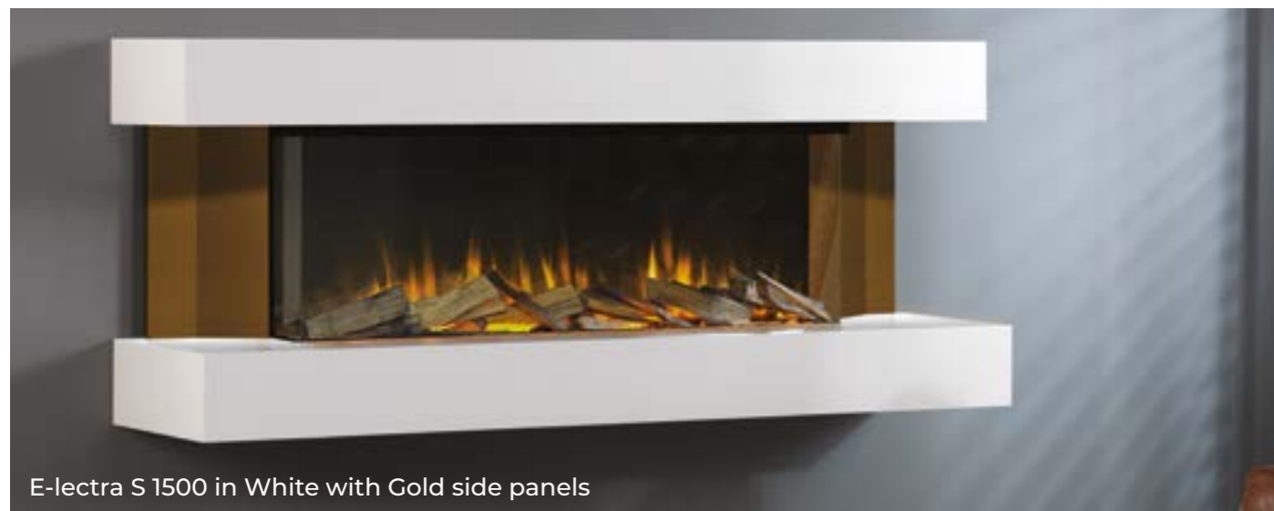
E-lectra S 1500 in White with Gold side panels