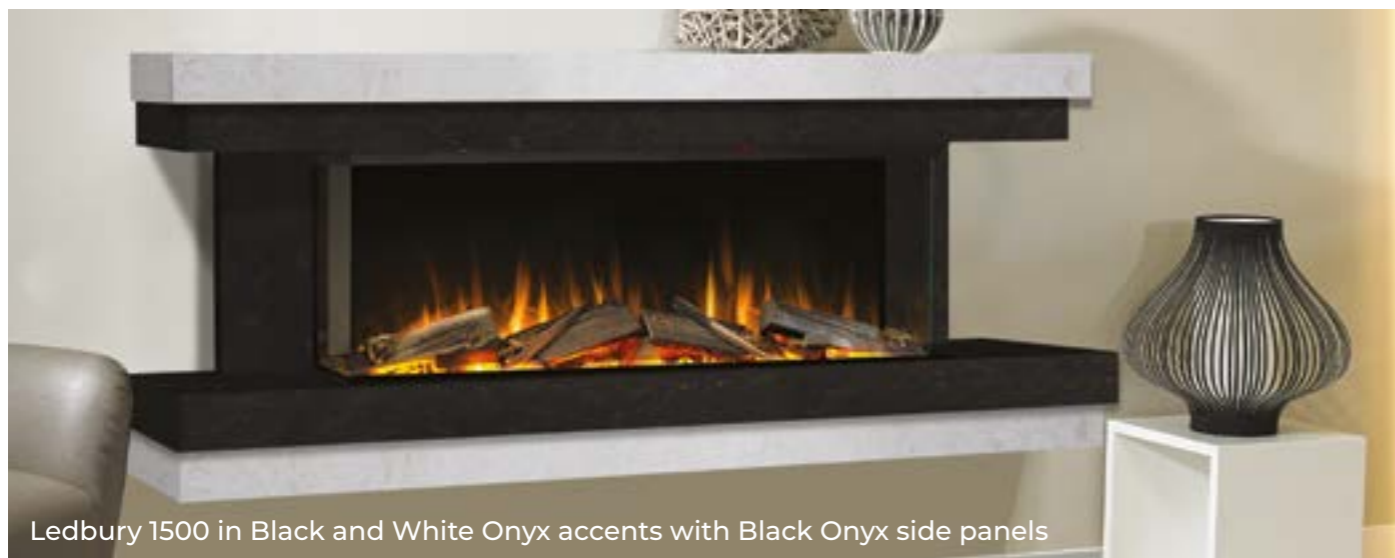
Ledbury 1500 in Black and White Onyx accents with Black Onyx side panels