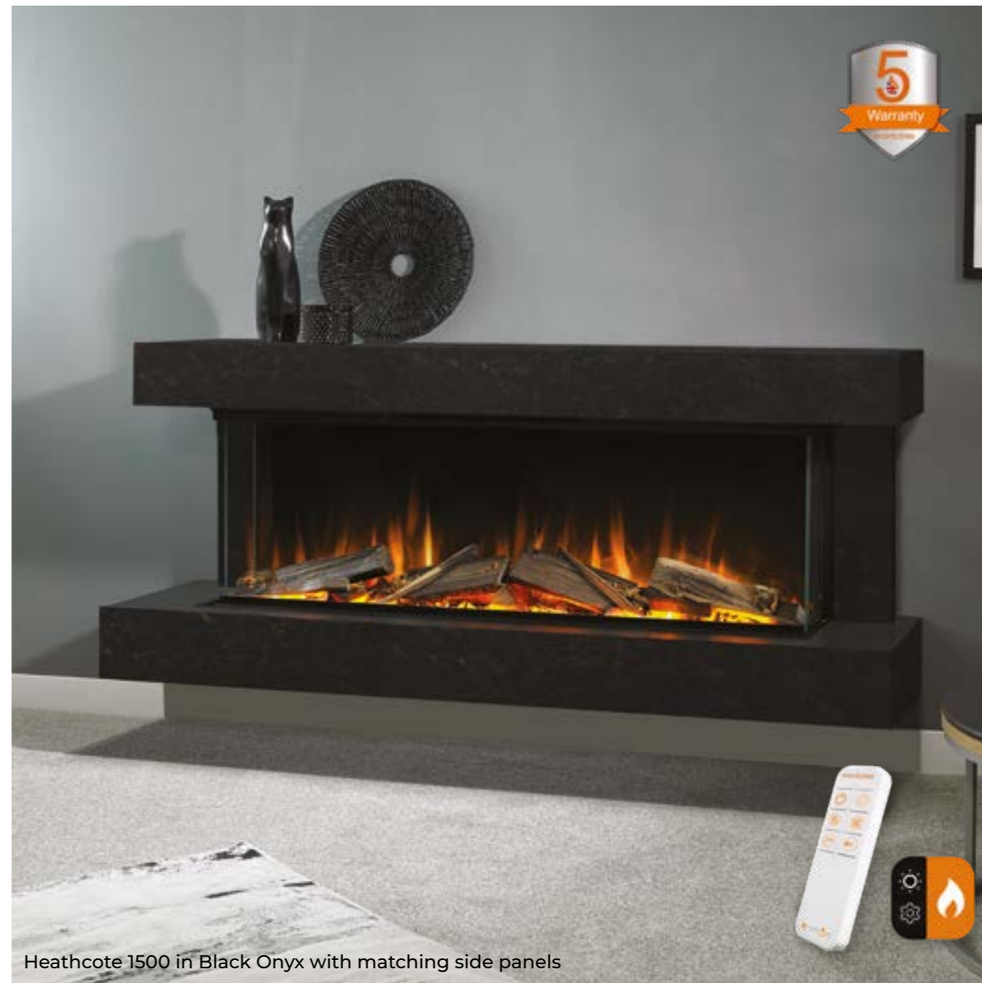
Heathcote 1500 in Black Onyx with matching side panels