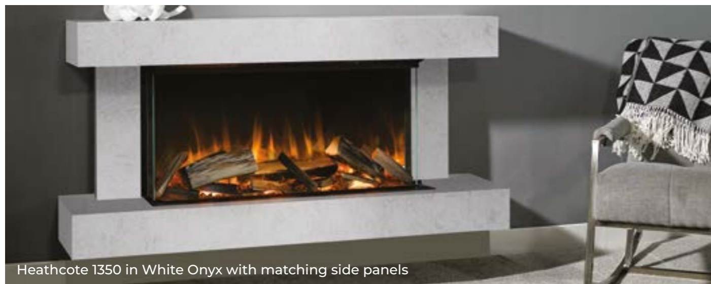
Heathcote 1350 in White Onyx with matching side panels