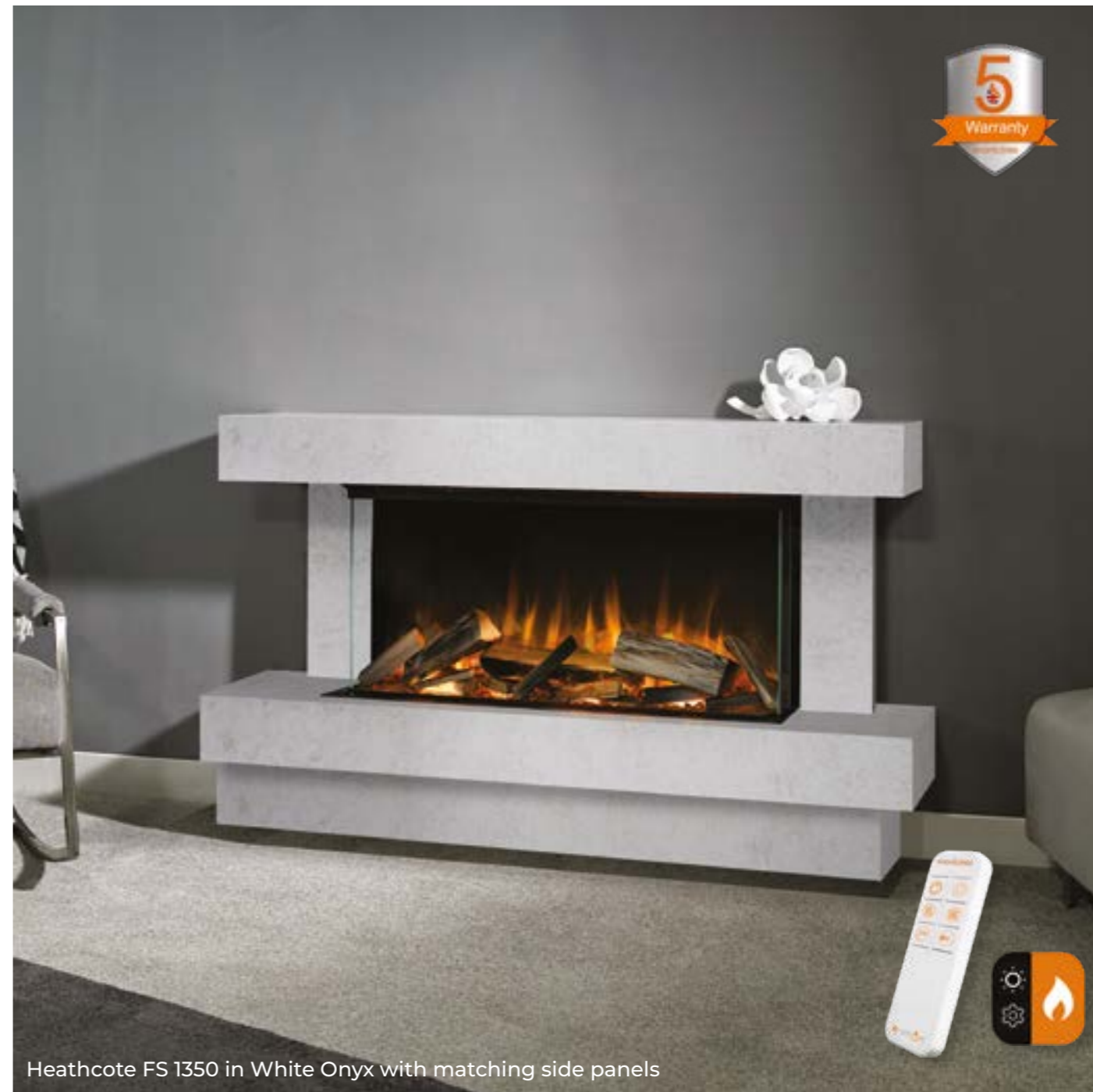
Heathcote FS 1350 in White Onyx with matching side panels