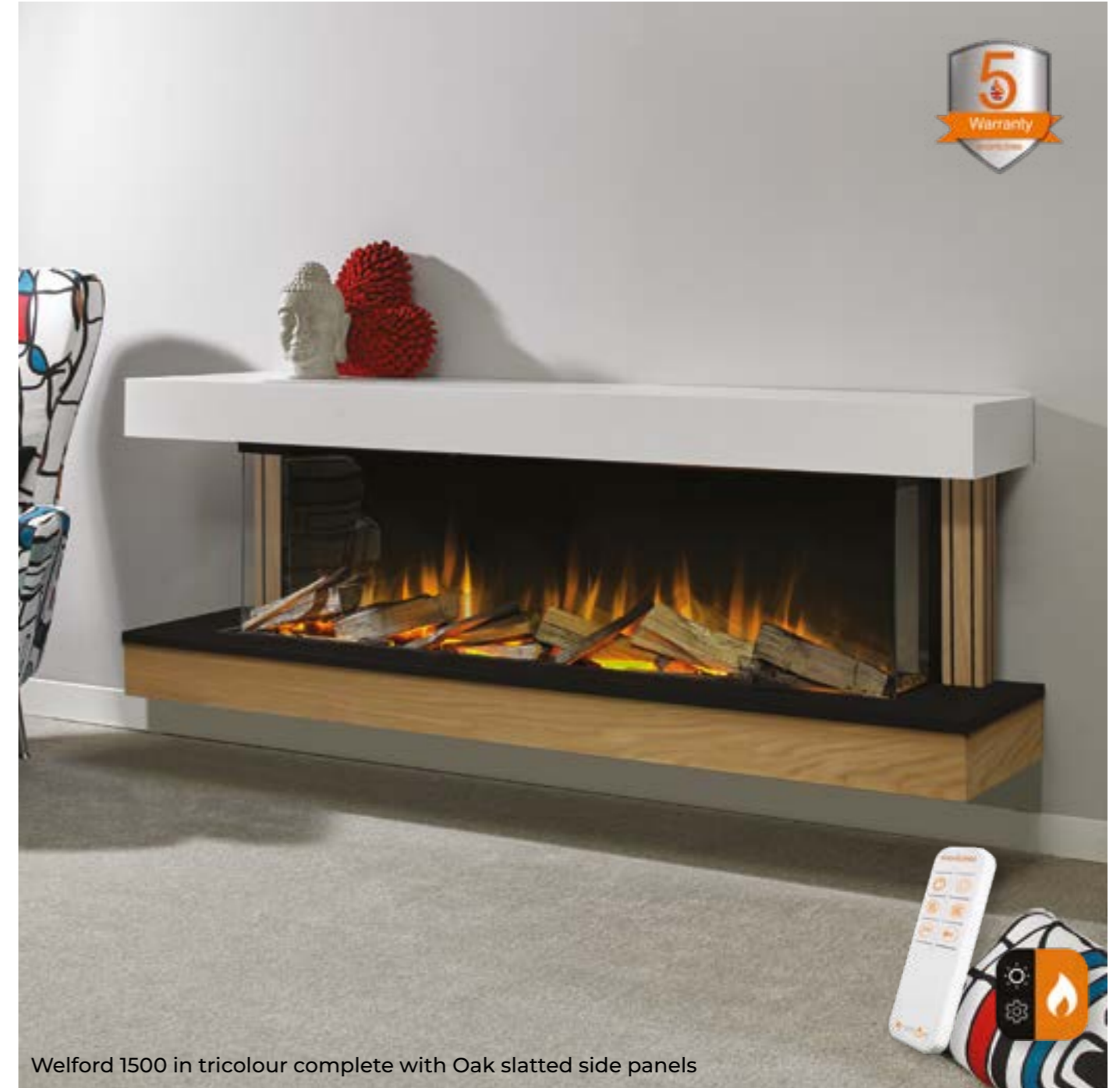
Welford 1500 in tricolour complete with Oak slatted side panels