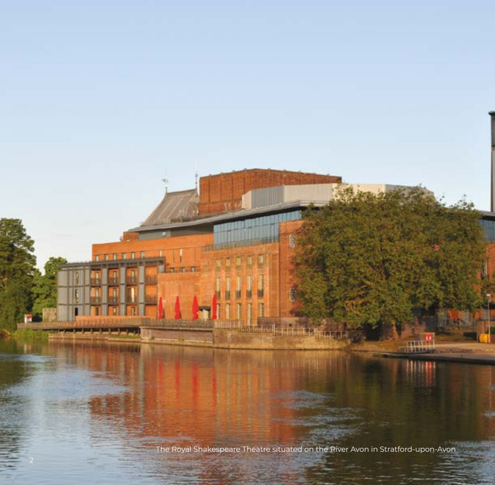
The Royal Shakespeare Theatre situated on the River Avon in Stratford-upon-Avon