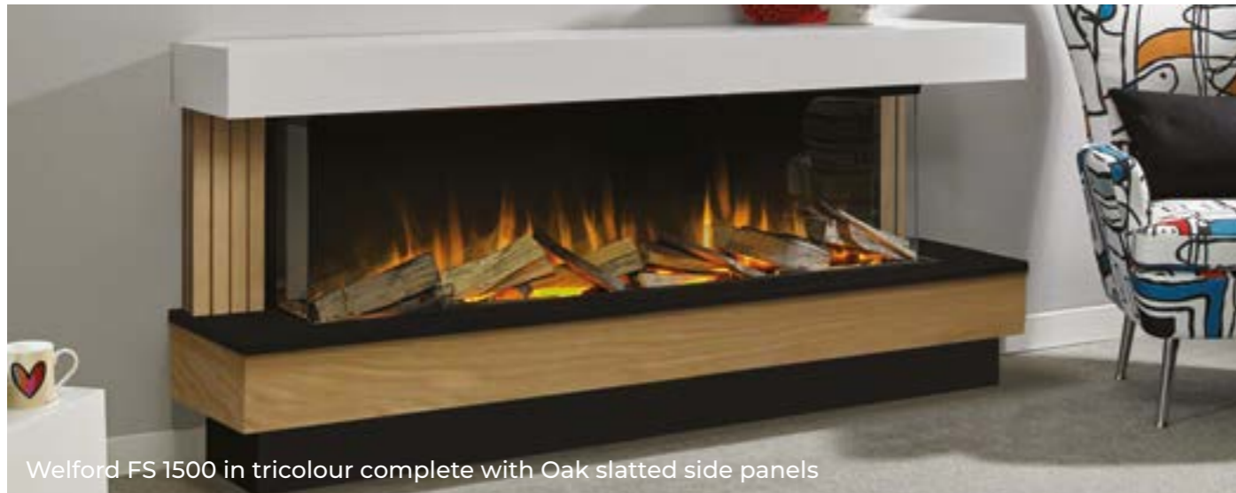
Welford FS 1500 in tricolour complete with Oak slatted side panels