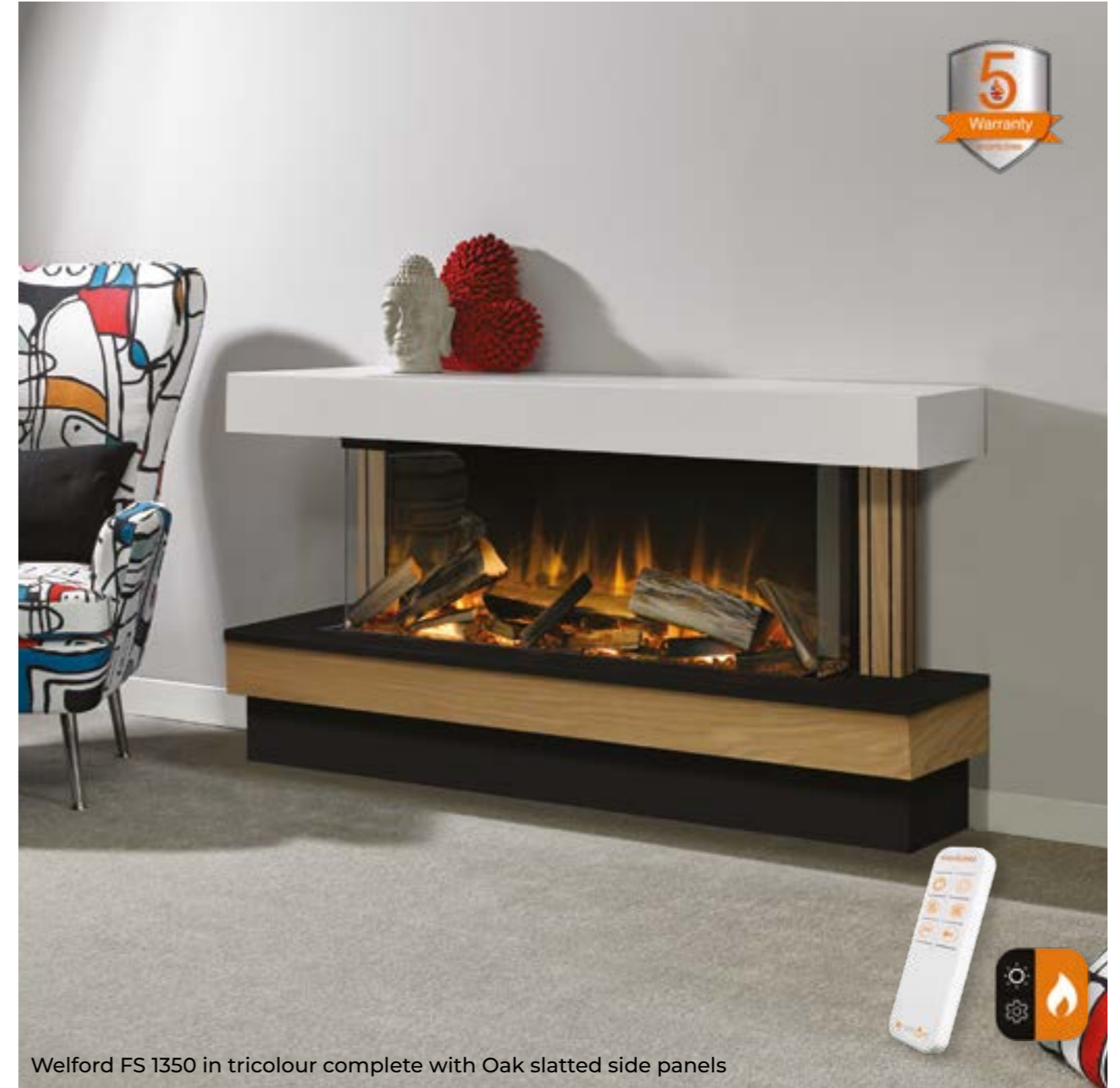
Welford FS 1350 in tricolour complete with Oak slatted side panels