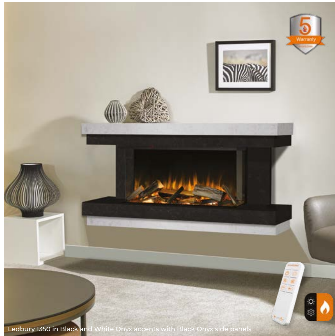
Ledbury 1350 in Black and White Onyx accents with Black Onyx side panels