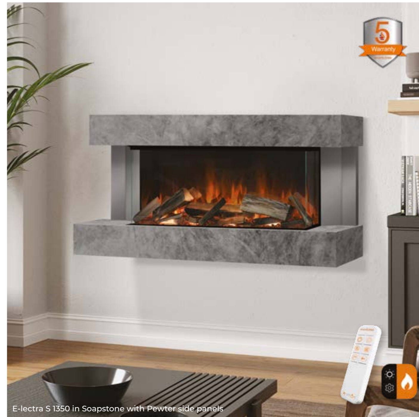
E-lectra S 1350 in Soapstone with Pewter side panels